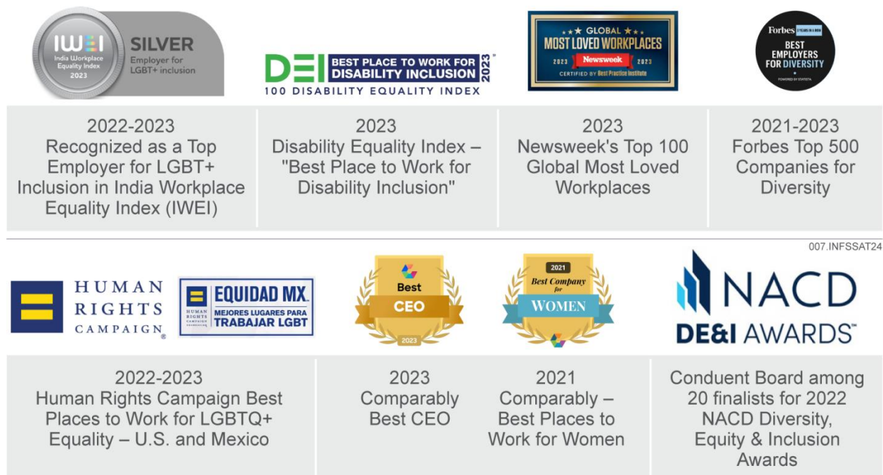
Figure 2.2-2. Industry Awards and Recognition. Conduent is recognized for our commitment to DE&I